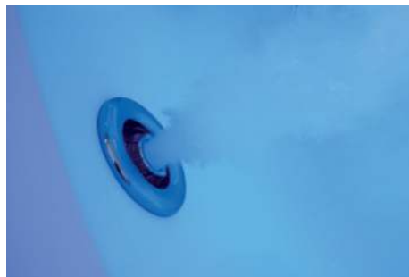
Getto Whirlpool Whirlpool jet