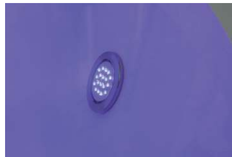
Faro cromoterapia Chromotherapy LED light