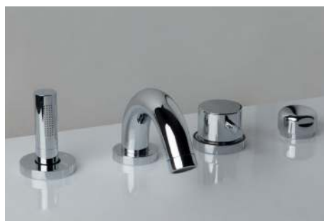
Rubineria 4 fori Four-hole tap set