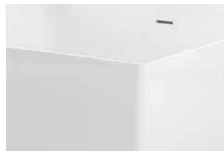
Trotopieno Overflow drain built-in