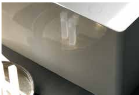
Finitura esterna bianca lucida External glossy finish