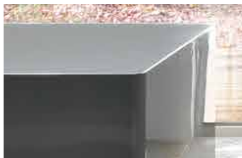
Bordo arrotondato Rounded edge