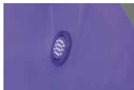
Faro cromoterapia Chromotherapy LED light