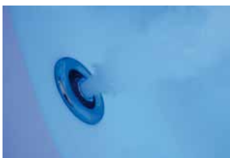
Getto Whirlpool Whirlpool jet