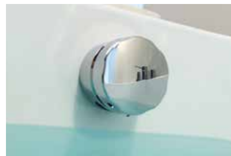
Colonna di scarico con erogatore Overflow drain inclusive of fill spout