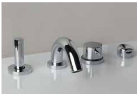
Rubineria 4 fori Four-hole tap set